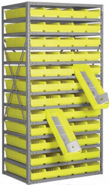
MSB2404-7-60 (13-Shelf Unit)