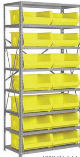
MPB1416-7-14 (8-Shelf Unit)