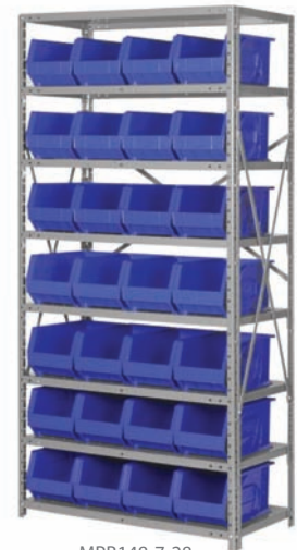
MPB148-7-28 (8-Shelf Unit)