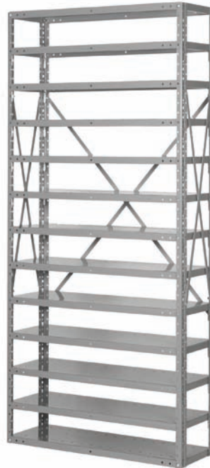
M1236-13 (13-Shelf Unit)