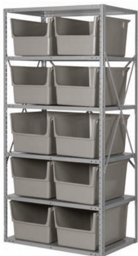
MNO2415-12-10 (6-Shelf Unit)