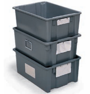
Identification Options (Snap-On and Adhesive Cardholders) (See pg. 39).