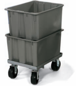
SN2117-12 on Dolly