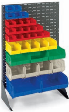
LPFS1-BST shown with PB54-3, PB74-3, PB105-5, PB108-7, PB1011-5 and PB1416-7

Boost workstation efficiency with LEWISBins+ Louvered Panel Floor Stands. Stands are available in single or double sided styles. Pre-configured systems with bins are available or bins can be ordered separately. Single sided Floor Stands hold up to 800 lbs and double sided Floor Stands hold up to 1,600 lbs. Optional Mobile Kits add instant mobility.