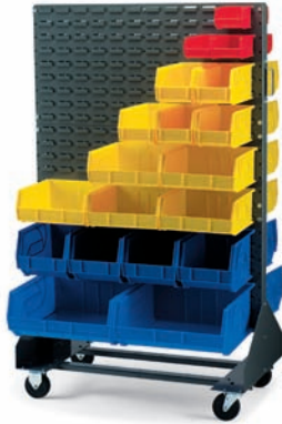
LPFS2-BST shown with PB54-3, PB74-3, PB105-5, PB108-7, PB1011-5, PB1416-7, and MK4000-B (mobile kit)