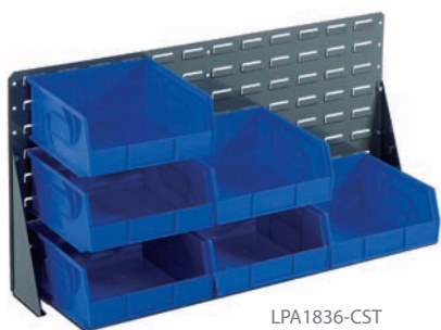
LPA1836-CST shown with PB1011-5

Organize your workbench with LEWISBins+ easy-to-assemble Bench Assemblies. Durable Louvered Panels are accompanied by 16-gauge steel legs that can be added with fasteners. Pre-configured systems with bins are available or bins can be ordered separately. Louvered Panel Bench Assemblies hold 100-130 lbs.