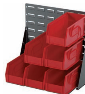
LPA1818-CST Shown with PB105-5

** Load Capacity, including bin weights.