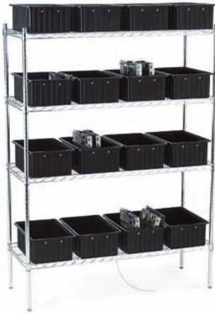
W4818-63C Starter shown with DC2060-SXL

Organize workstations instantly with Wire Shelving. Easy to assemble and configure.